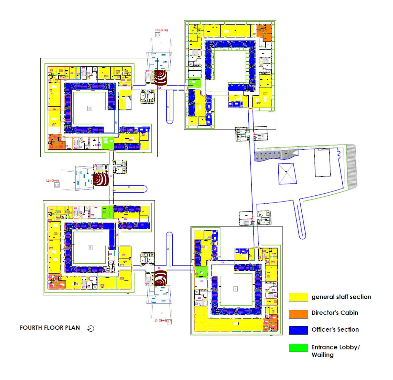
Sd/Chief Executive Officer Naya Raipur Development Authority